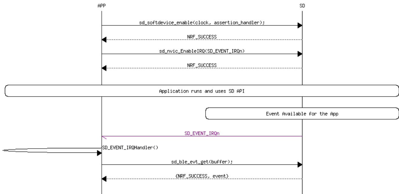
Figure 2 Sequence chart showing the initialization and event handling of an S110 application

Events are delivered to the application as a pointer to a C structure. This structure will contain different data depending on the type of event that the application can process and act upon. The event structures for different modules are defined in the header file of the corresponding layer (such as ble_gatts.h , ble_gap.h ).